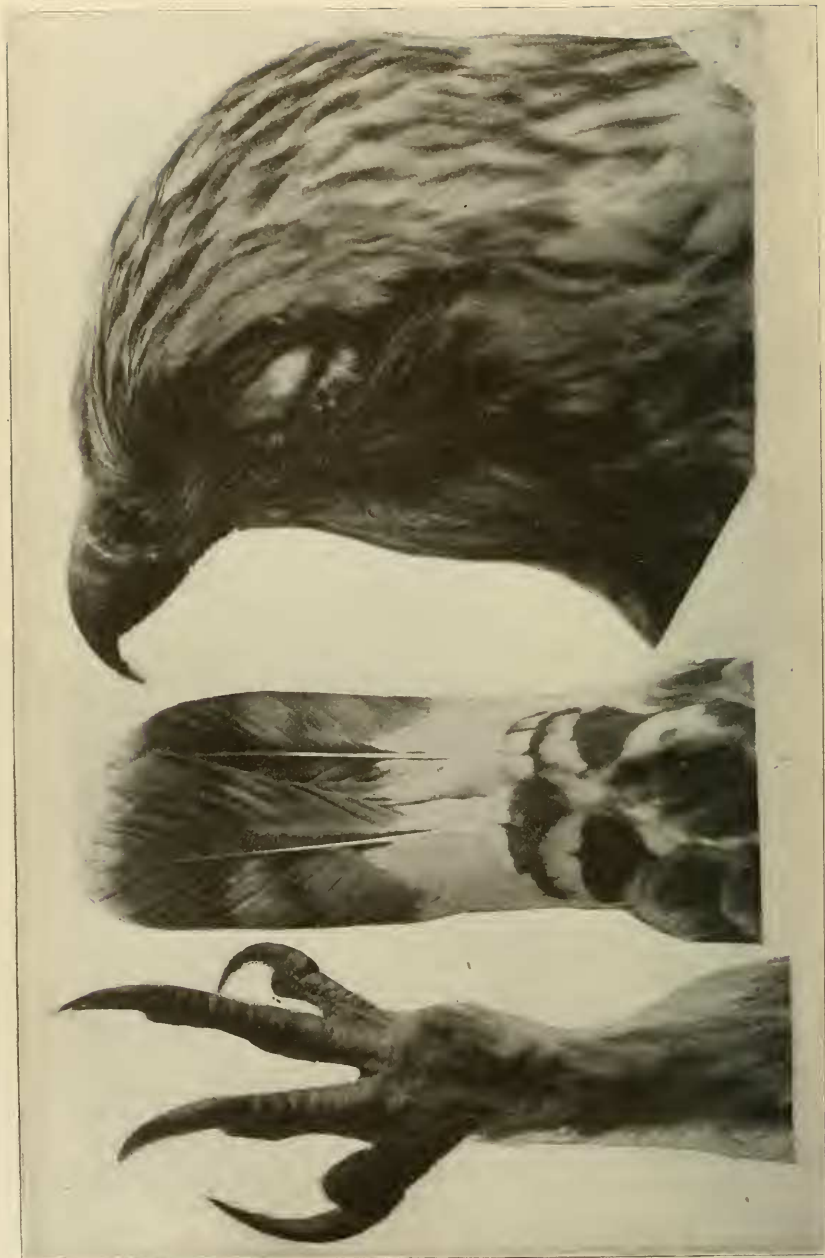
Archibuteo lagopus sancti-johannis , Rough-legged Hawk.